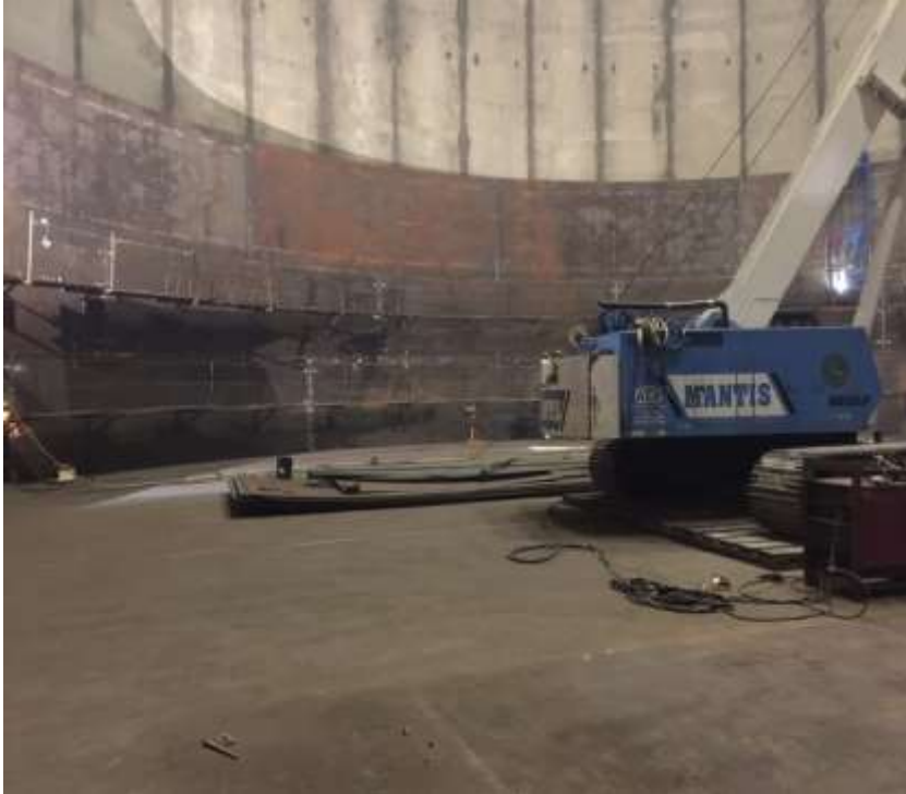
Inner Tank 3rd Row Plate Placement